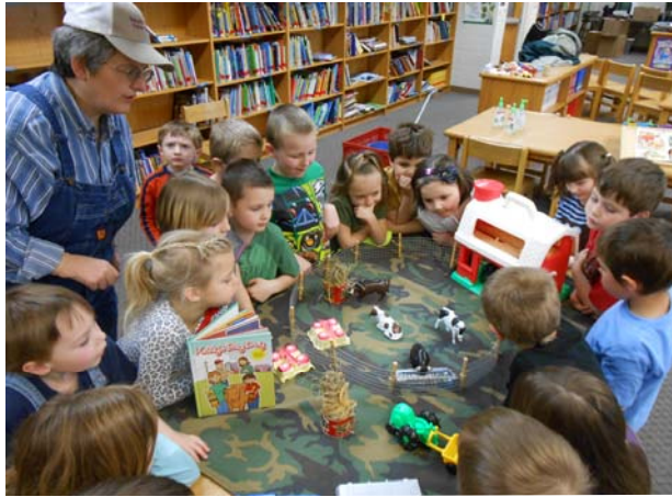
Children in Smyth County learn about cattle from the most reliable source!

From March 18 th through March 23 rd , over 1,900 volunteers from agricultural organizations and businesses